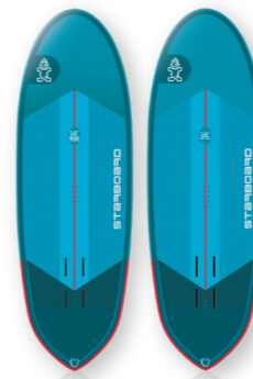
AIR FOIL CARBON / AIR FOIL